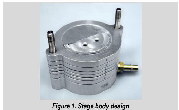
Figure 1. Stage body design

The Models 135-6 and 135-8 can be used with personal sampling pumps since they have a low pressure drop. The Model 135-10 requires a vacuum pump due to the larger pressure drop associated with the last two stages.