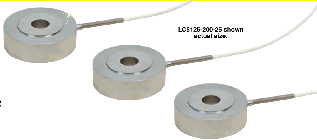
LC8125-200-25 shown actual size.

Output: 2 mV/V nominal Input: 10 Vdc (15V maximum) Accuracy: ±1.0% linearity, hysteresis and repeatability combined Zero Balance: ±2.0% FSO Operating Temp Range: -54 to 121°C (-65 to 250°F) Compensated Temp Range: 16 to 71°C (60 to 160°F) Thermal Effects: Zero: ±0.009% FSO/°C Span: ±0.018% rdg/°C Safe Overload: 150% of capacity Ultimate Overload: 300% of capacity Deflection: 0.075 mm (0.003") nominal Input Resistance: 360 Ω minimum Output Resistance: 350 ±5 Ω Construction: 17-4 PH stainless steel Electrical: 1.5 m (5') 4-conductor shielded cable