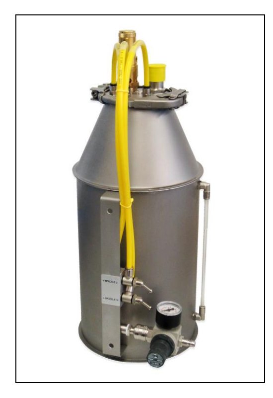
Aerosol Generators series ATM 241

The aerosol generator ATM 241 is a droplet generators and especially developed for generating high aerosol concentrations with exceptional constancy (VDI-guidline 3491).