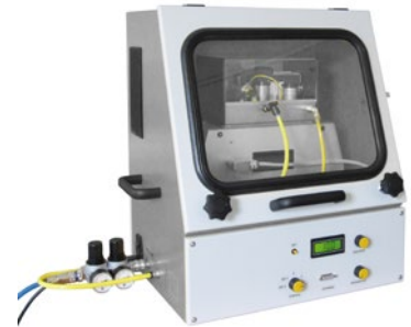
Model 3413U: Dust aerosol generator inside full enclosure for difficult powders